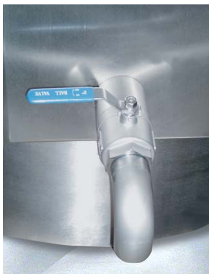
THERMOREGULATED MANUAL WASTE OUTLET