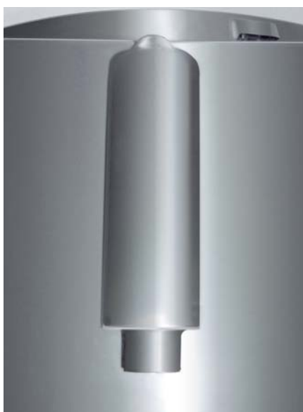
OVERFILLING WITH FREE EXIT WITH CONTAINER FOR THE RECOVERY OF WATER